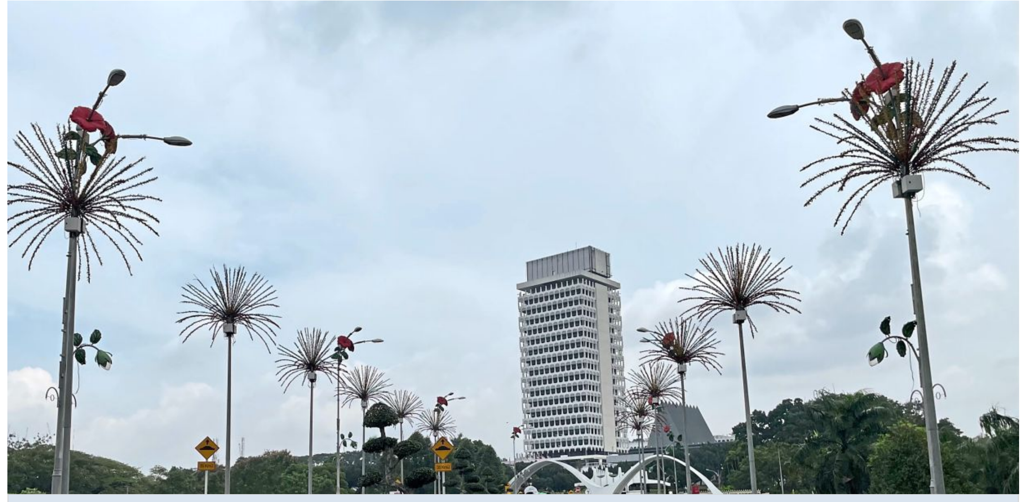
History in the making: This is the first time that Dewan Rakyat is convening since adjourning 'sine die' in December last year after passing Budget 2021.

PETALING JAYA: The historic five-day special sitting of Dewan Rakyat begins today under a cloud of dramatic surge in daily Covid-19 infections. which have gone over 17,000 cases.